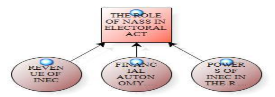
Figure 1.0Model On The Role Of NASS In The Electoral Acts, Showing Three Sub-Themes Under Electoral Acts

This Part Of The Paper Focuses On The Analysis And Discussion Of Findings Of The Research, The Role Played By The Legislature In Electoral Reform. The Problem Of The Elections In Nigeria Has Been Identified From Two Major Aspects, Weakness Of The Electoral Institution And The Flaw Of Electoral Regulation Documents (Constitution And Electoral Act 2006). (Report Of Justices Uwais Committee, 2009). The Reform Targeted Two Major Issues The Composition Of The Electoral Body And Its Source Of Finance. This Is Discussed Under One Theme And Three Sub-Themes.